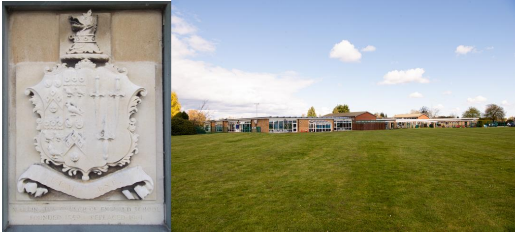
Werrington Primary School Crest and playing field

Werrington is a 'village' on the edge of Werrington township, dating back to Norman times and is within the City of Peterborough. The school is situated in the centre of the village and is surrounded for the most part by private housing.